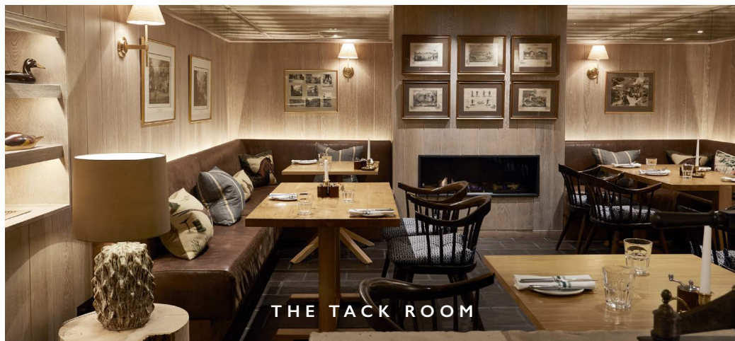
THE TACK ROOM