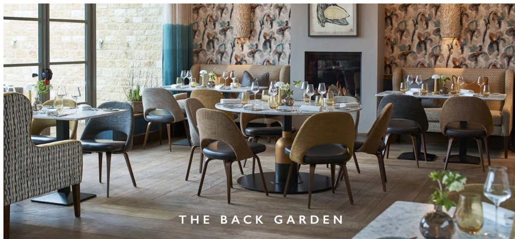
THE BACK GARDEN