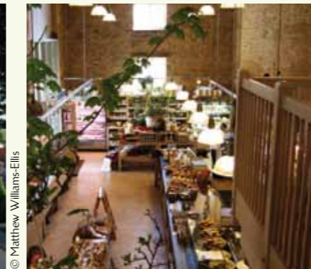
Daylesford Organic Discover the very best in organic produce – plus a range of chic and stylish gifts and homeware – at the most famous farmshop of all. www.daylesfordorganic.com