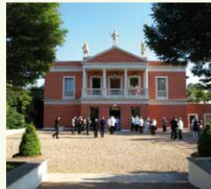
Longborough Festival Opera Discover seriously good opera in a superb setting – the 2010 season runs through June/July. www.lfo.org.uk