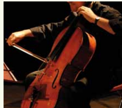
Chipping Campden Festivals 2010 Discover two festivals in the Cotswolds' most enchanting town – the Literature Festival and Music Festival, both taking place in May.