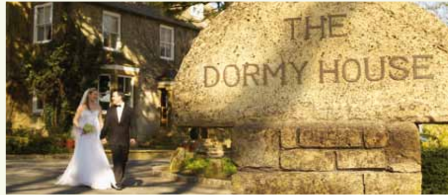
Your Wedding Discover the perfect venue for your big day – talk to us about our special 'My day's Friday' packages for 2010.