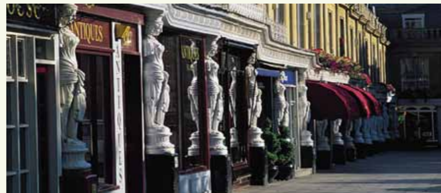
Cheltenham Festivals 2010 Discover four fantastic festivals on the Dormy's doorstep – Jazz (28 April-3 May), Science (9-13 June), Music (2-17 July) and Literature (8-17 October). One of England's finest Regency towns comes alive with world-class arts and entertainment. www.cheltenhamfestivals.com