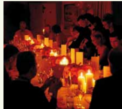
Private Dining Discover the discreet charm of our private dining rooms, for parties of eight or more.