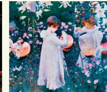
Broadway Arts Festival Discover a range of artistic events and happenings at the biennial Festival in our nearest village, from 11-20 June. www.broadwayartsfestival.com