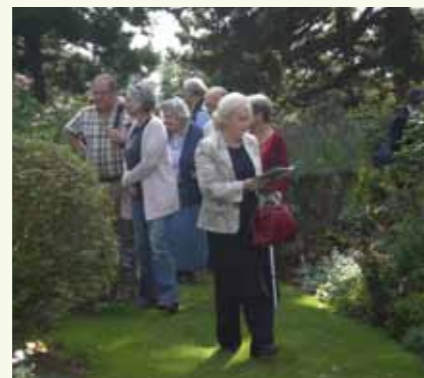
Exclusive Garden Tours Discover the great gardens of the Cotswolds with our special escorted four-day tours. Call for a brochure.