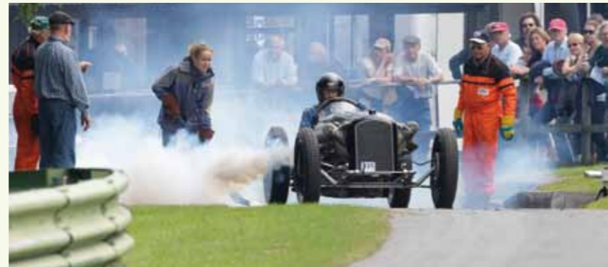
Prescott Speed Hill Climb Discover the unique spectacle of the quintessentially English motorsport of Hill Climb – a glorious day out in nearby Gloucestershire. www.prescott-hillclimb.com