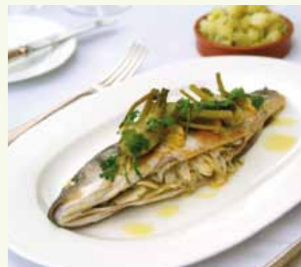
'Eat to live' choices Discover wholesome healthy options on both lunch and evening menus in The Dining Room and Barn Owl.