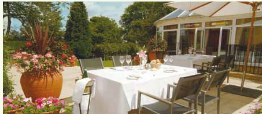
Let's do Lunch! Discover that The Dining Room is now open for lunch on Fridays and Saturdays, as well as Sundays – treat yourself to our Let's do Lunch! menu (3 courses at £21.50, available Friday and Saturday).