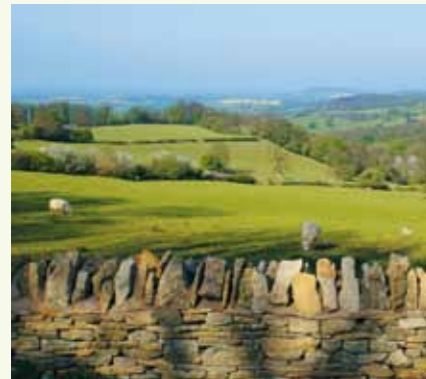
Dormy Walks Discover the ever-changing landscape of the Cotswolds on our three circular walks – route maps with full commentary provided.